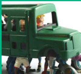
3D Gallery Group Show Thinking about Green Various Media